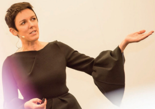
1 OF 4 FEATURED KEYNOTES SYLVIE DI GIUSTO